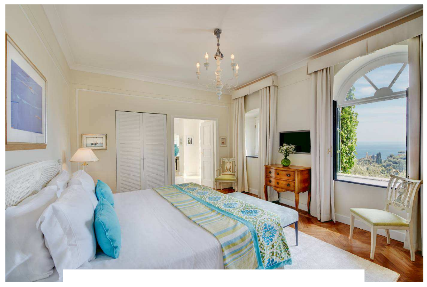
The suite is well furnished and tastefully appointed in delicate pastel colours that complement the panoramic views of Portofino Bay.

It also boasts a large bathroom featuring separate shower and bathtub and double basins, plus a second smaller one. The private garden is complete with loungers, perfect for soaking up the dazzling Italian sun.