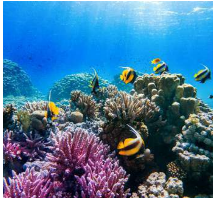
Colorful corals and exotic fishes at the bottom of the Red Sea