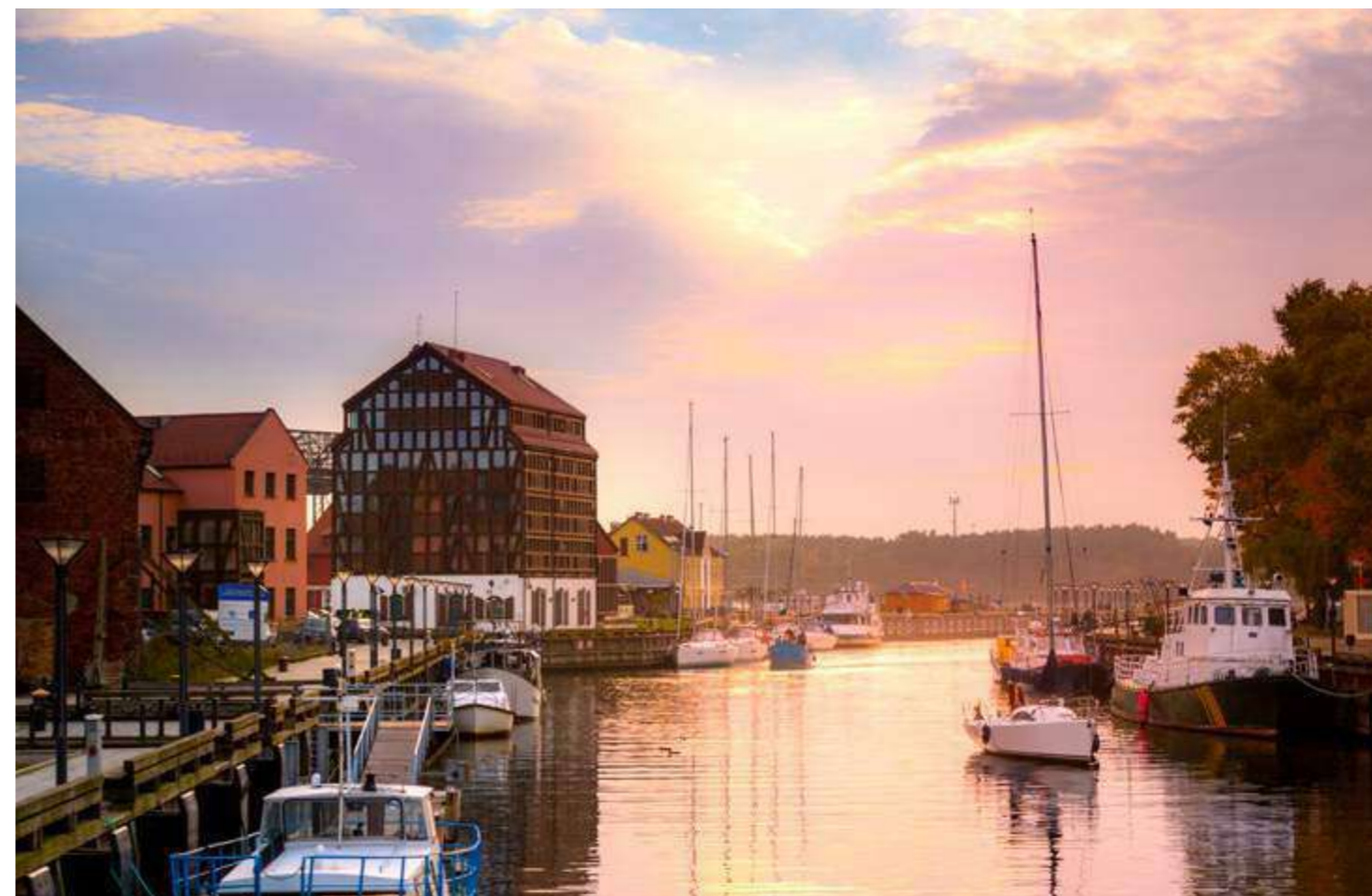
Sunset in the harbor. Klaipėda, Lithuania