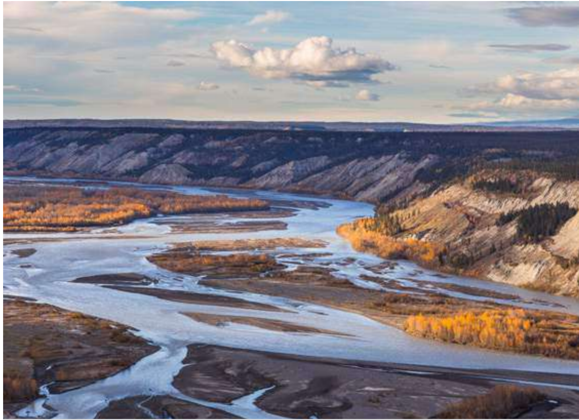
Wrangell-St. Elias National Park and Preserve is one of the highlights of our itinerary

“To say Alaska and the Russian Far East are scenically spectacular is no understatement. These itineraries allow guests to enjoy new destinations in a region that is an extraordinary fusion of wildlife, heritage and nature.”