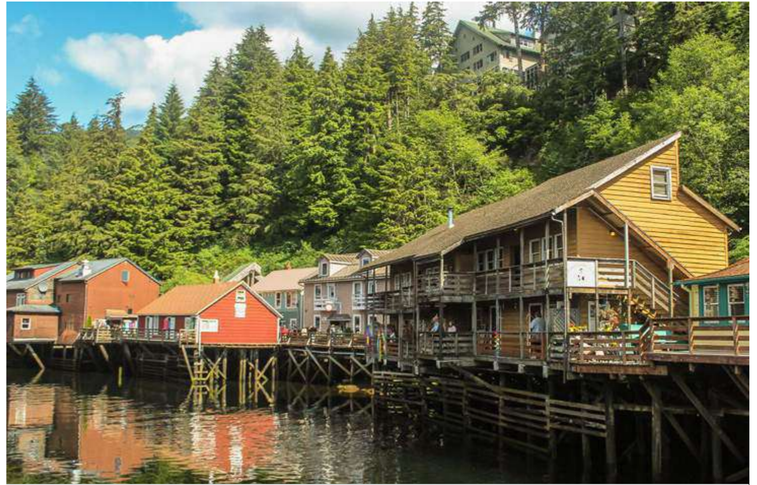
Our Alaska itineraries visit the beautiful Skagway