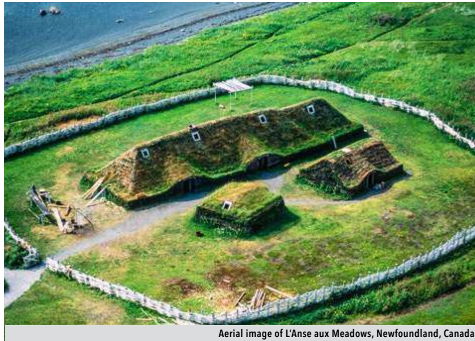
Aerial image of L'Anse aux Meadows, Newfoundland, Canada

Welcome to our first ever season of summer sailings in Canada and New England. This year we wanted to experience the region during the warmer months and we wanted to do it aboard our lovely Silver Shadow. We have added a special focus on the northern part of the region, visiting Newfoundland in northern Canada. The long days will allow us greater discovery of the region, permitting us to offer guests a vast spectrum of scenic variety. We have also added longer stays in Boston, meaning you can enjoy the epic fall foliage at your leisure. 2023/2024 is the season to polish up your French! We will be returning to Montreal after a long hiatus. If you like included shore excursions, a choice of ocean-going and expedition itineraries and the promise of scenically spectacular vistas, then this is the region for you.