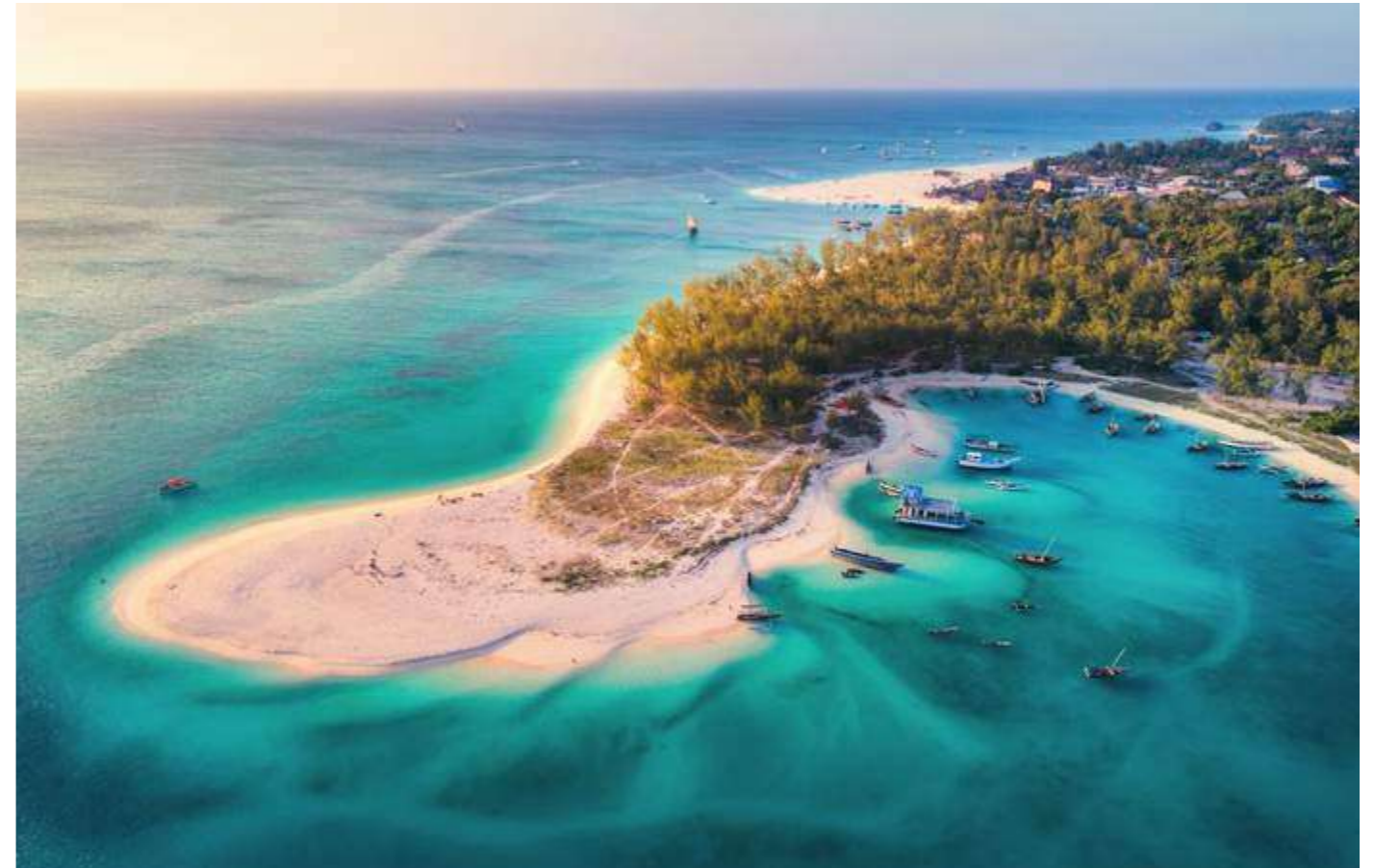
Aerial view of the fishing boats on tropical sea coast, Zanzibar

Africa and the Indian Ocean offer a world of sensations. This is a region that spills over with natural beauty, wherever you look. Think whale watching and safari games [ZR1] in South Africa, going off-grid in Saudi Arabia and fabulous snorkelling in the Seychelles. This season our pioneering spirit will lead us to the Comoros islands for the first time, as well take us on multiple voyages to the Arabian Peninsula for complete immersion of this mysterious destination. But that's not all! Our extensive itineraries are now even better than ever. We've added brand new destinations that offer in depth discovery of the Red Sea, extended stays in the Persian Gulf, multiple UNESCO World Heritage Sites and a cornucopia of experiences so you can really discover this fascinating region.