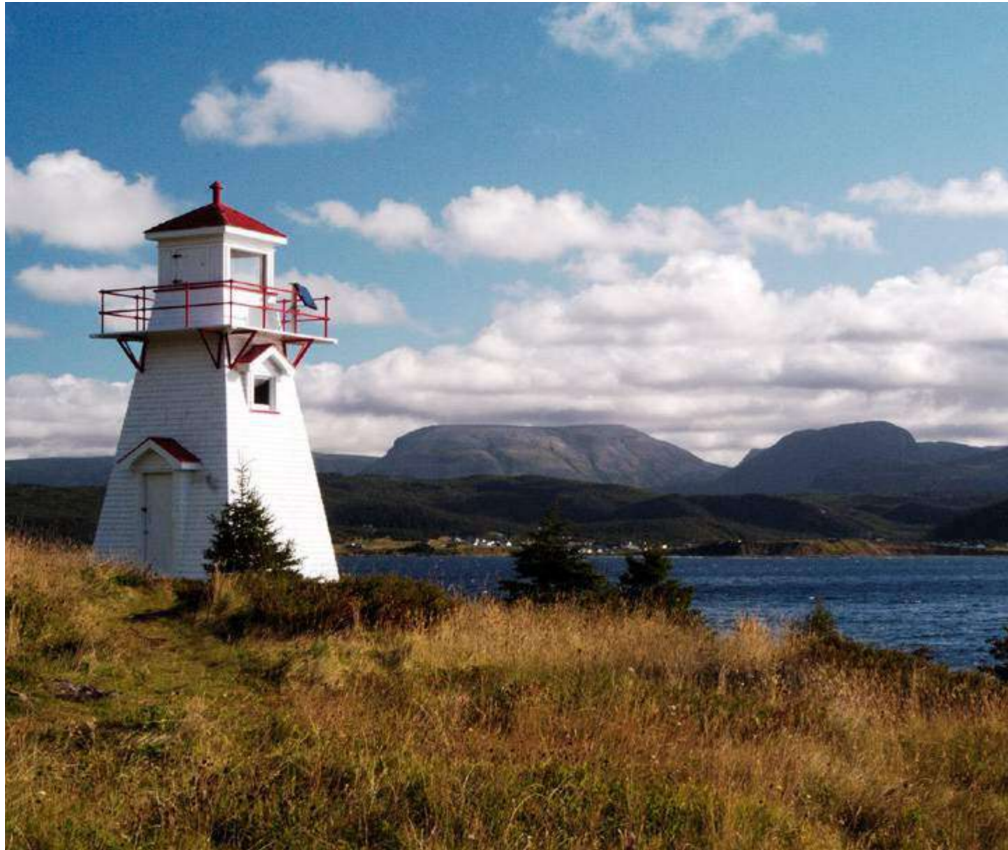
Woody Point Lighthouse looking over Bonne Bay toward Gros Morne mountain in the distance