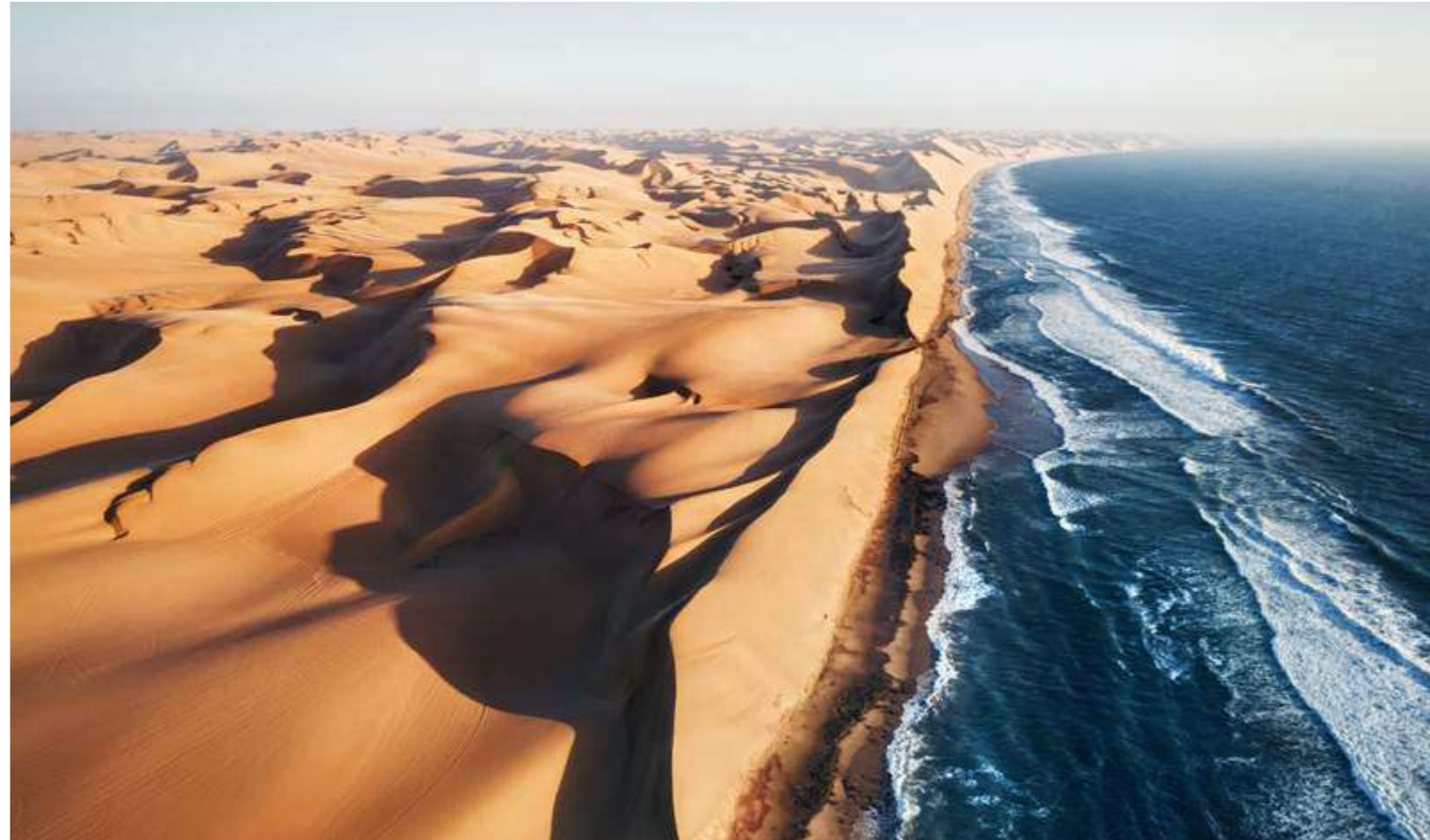
Place where Namib desert and the Atlantic ocean meets, Skeletoncoast, South Africa, Namibia