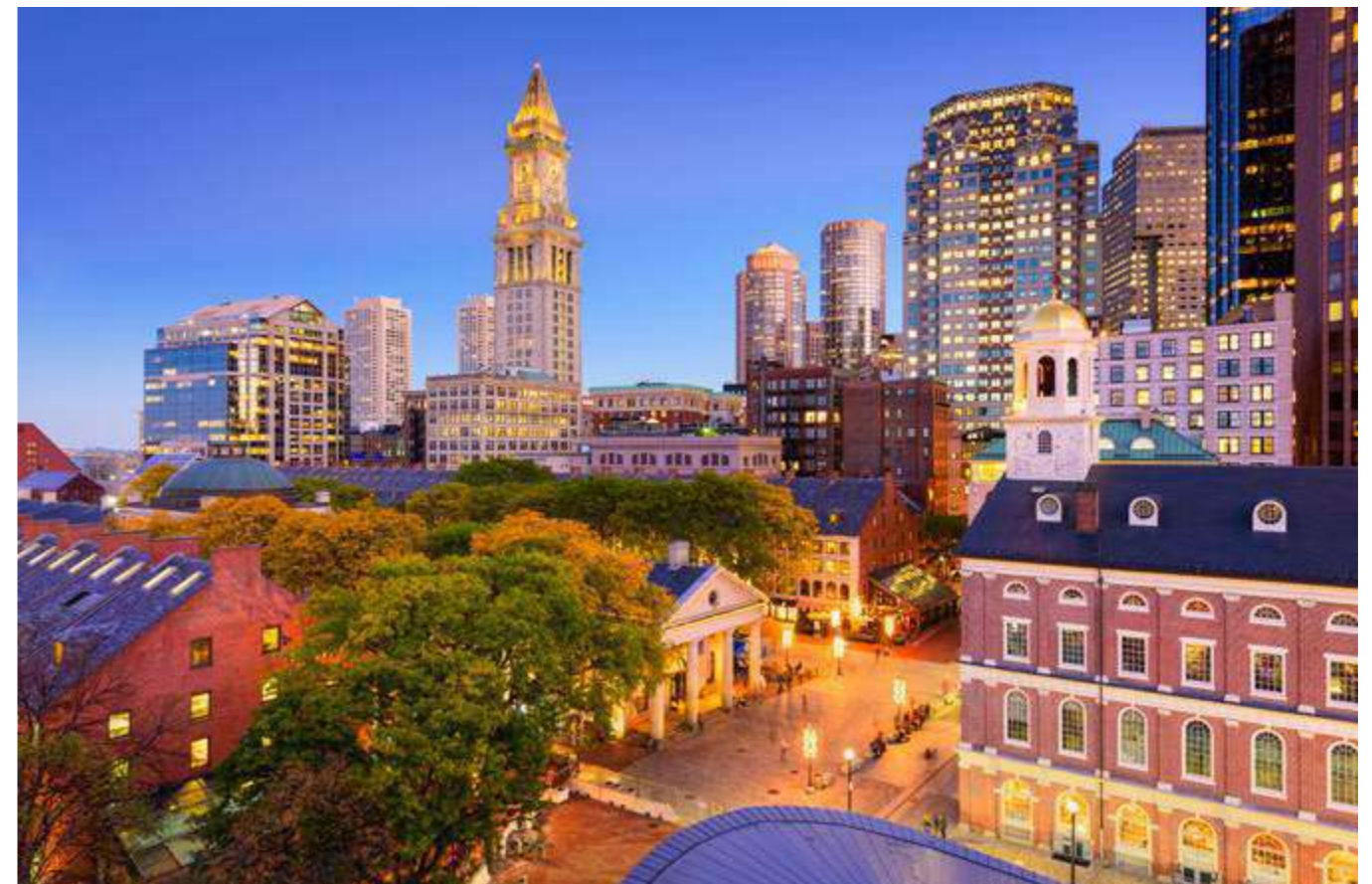
Boston, Massachusetts, USA

"I am delighted to announce our first ever summer season in Canada and New England. This innovation will allow us to explore the coasts of Newfoundland and offer guests an authentic travel experience like never before."