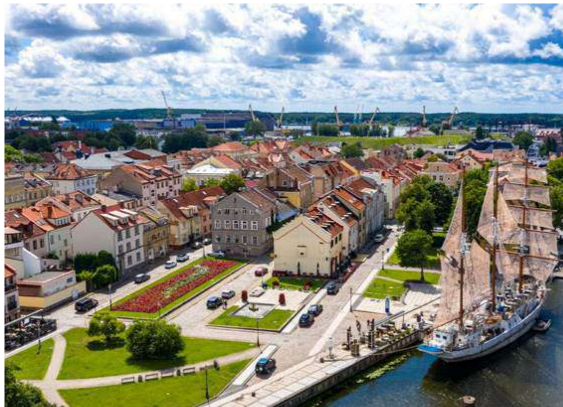
The educational vessel in Klaipėda