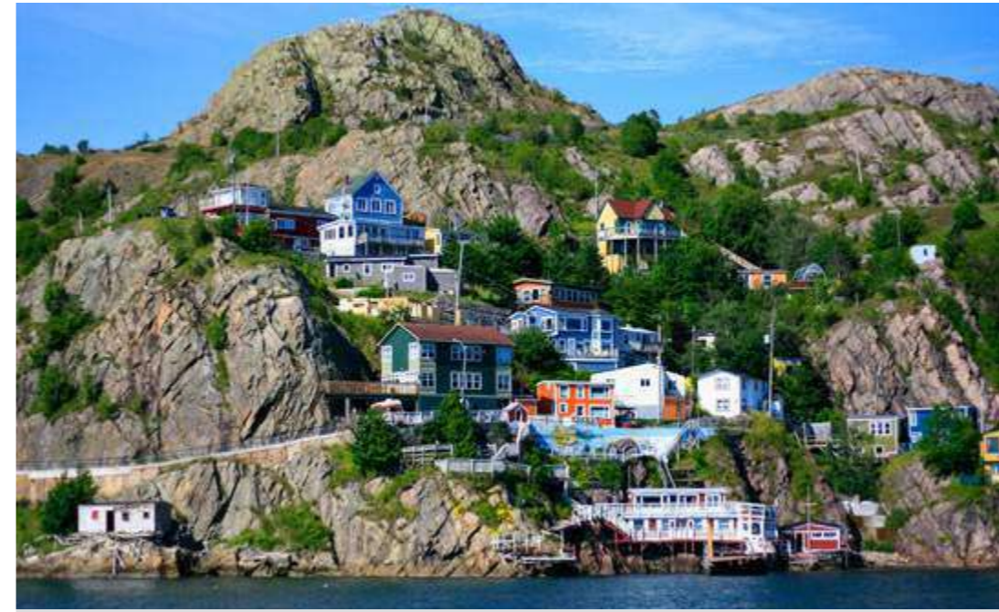
Colorful houses located on the hill in St. John's, Newfoundland