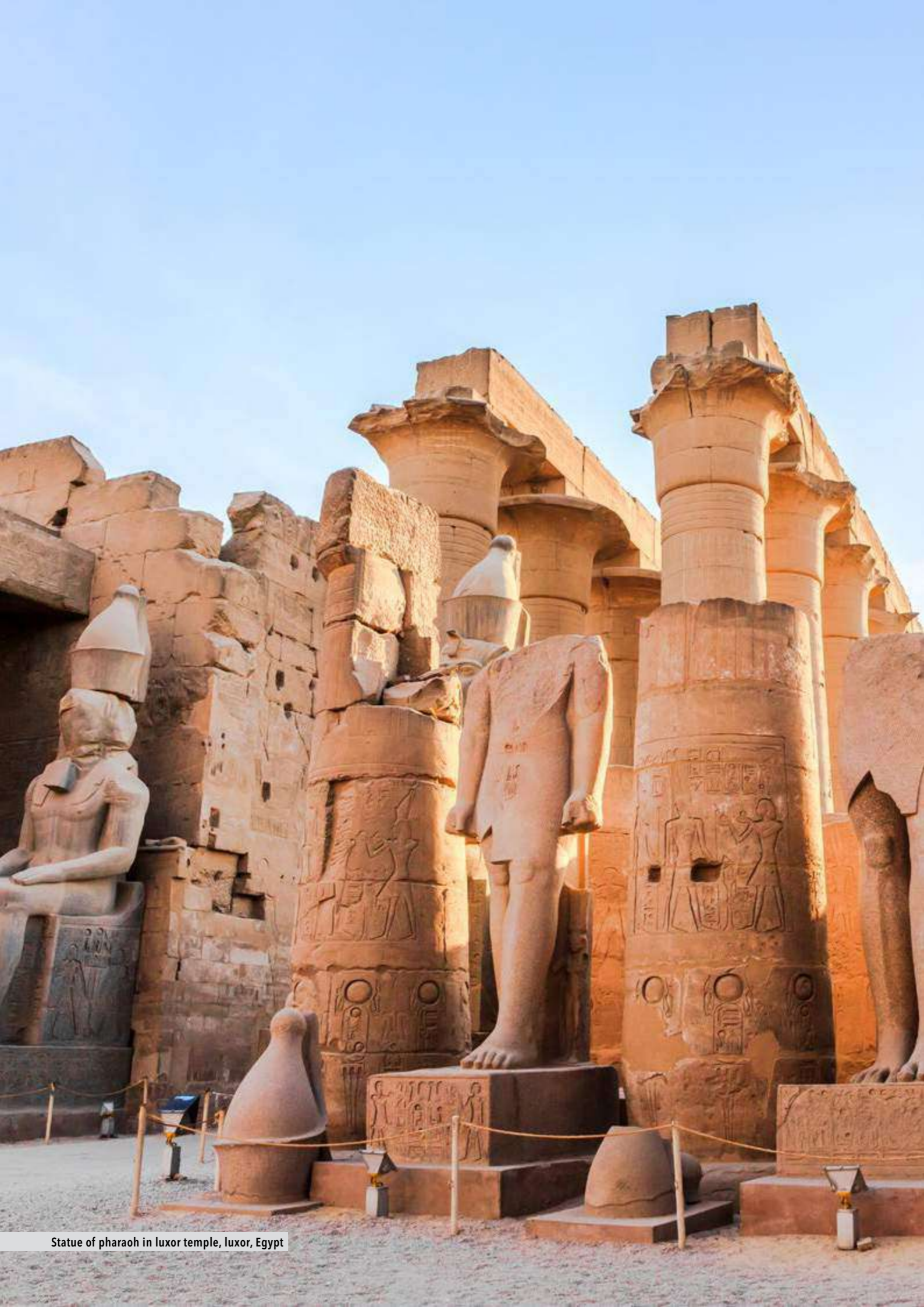
Statue of pharaoh in luxor temple, luxor, Egypt