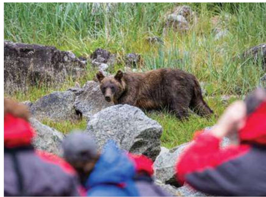
Brown bears and wildlife watching is the top highlight of our Alaska cruises