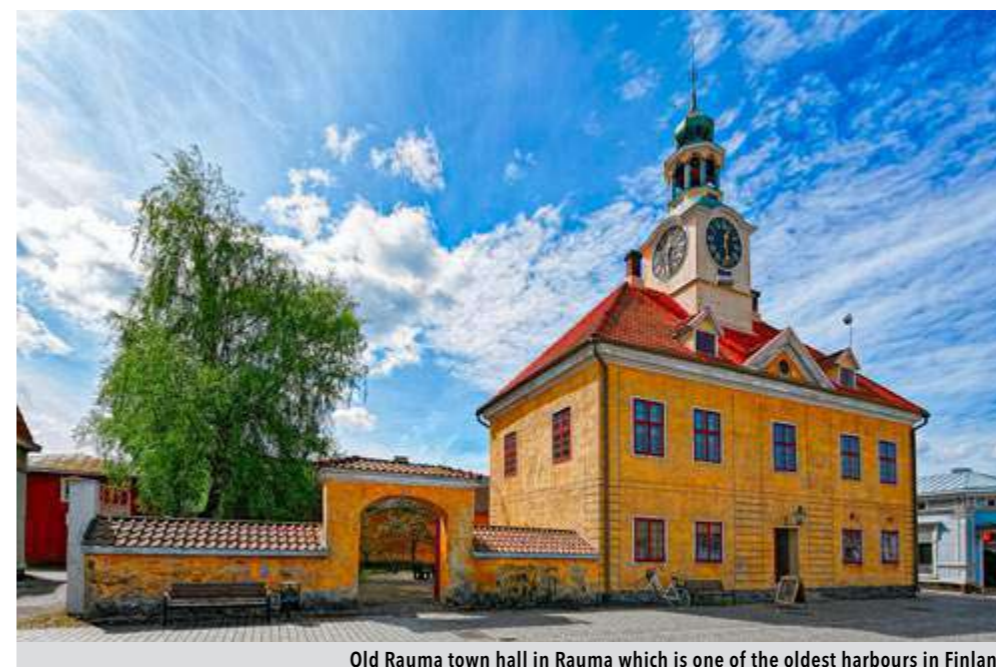
Old Rauma town hall in Rauma which is one of the oldest harbours in Finland

“We have worked hard to design new itineraries that take off-beaten-path, luxury travel to new heights. From unearthing remote destinations on the northern Finnish coast to late-season Norwegian Fjords cruises, our team of experts has made the impossible a reality.”