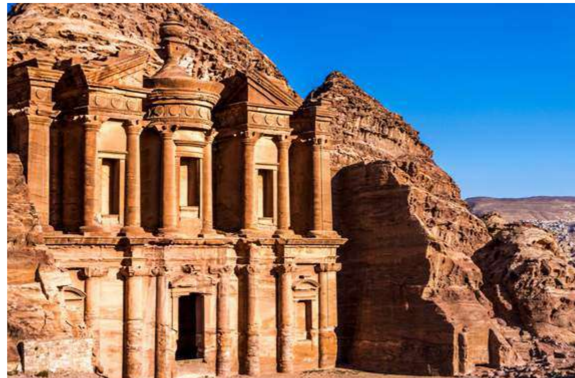
The Monastery - Petra, Jordan

“This is an epic voyage that truly showcases vast bio diversity while simultaneously exploring the virgin territory and ancient landscape of a spectacular continent.”