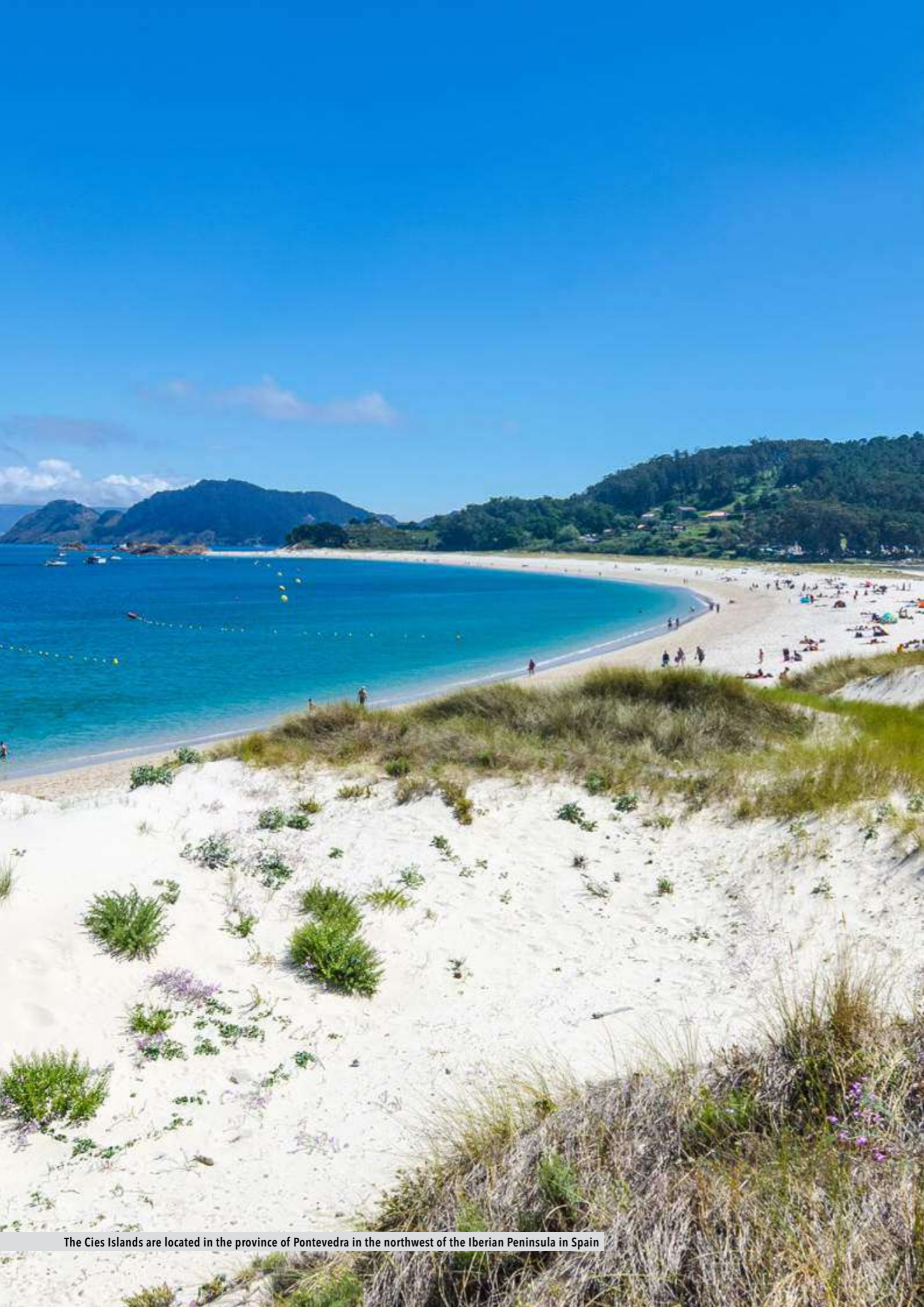
The Cies Islands are located in the province of Pontevedra in the northwest of the Iberian Peninsula in Spain