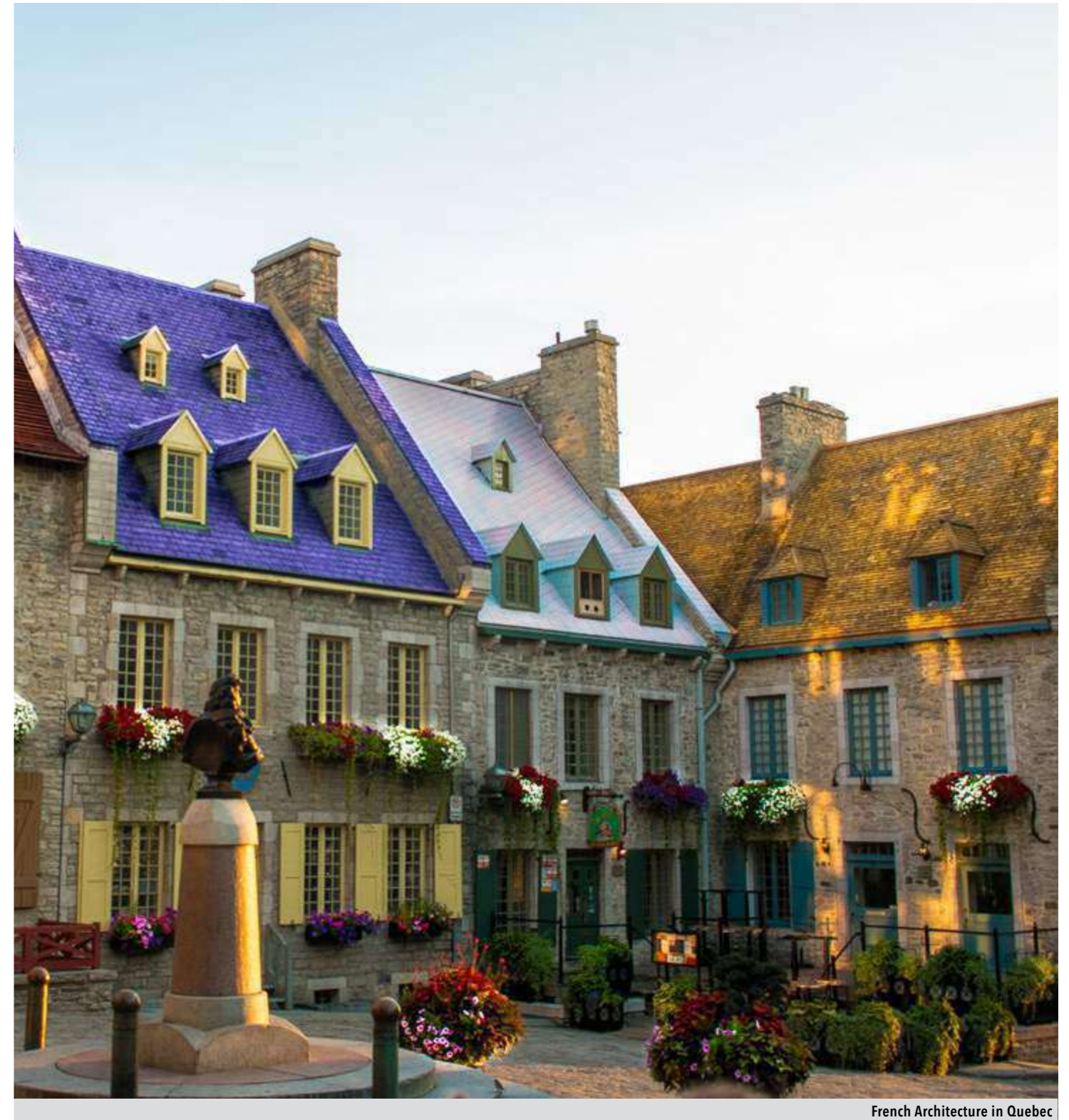
French Architecture in Quebec

Welcome to our first ever season of summer sailings in Canada and New England. This year we wanted to experience the region during the warmer months and we wanted to do it aboard our lovely Silver Shadow. We have added a special focus on the northern part of the region, visiting Newfoundland in northern Canada. The long days will allow us greater discovery of the region, permitting us to offer guests a vast spectrum of scenic variety. We have also added longer stays in Boston, meaning you can enjoy the epic fall foliage at your leisure. 2023/2024 is the season to polish up your French! We will be returning to Montreal after a long hiatus. If you like included shore excursions, a choice of ocean-going and expedition itineraries and the promise of scenically spectacular vistas, then this is the region for you.