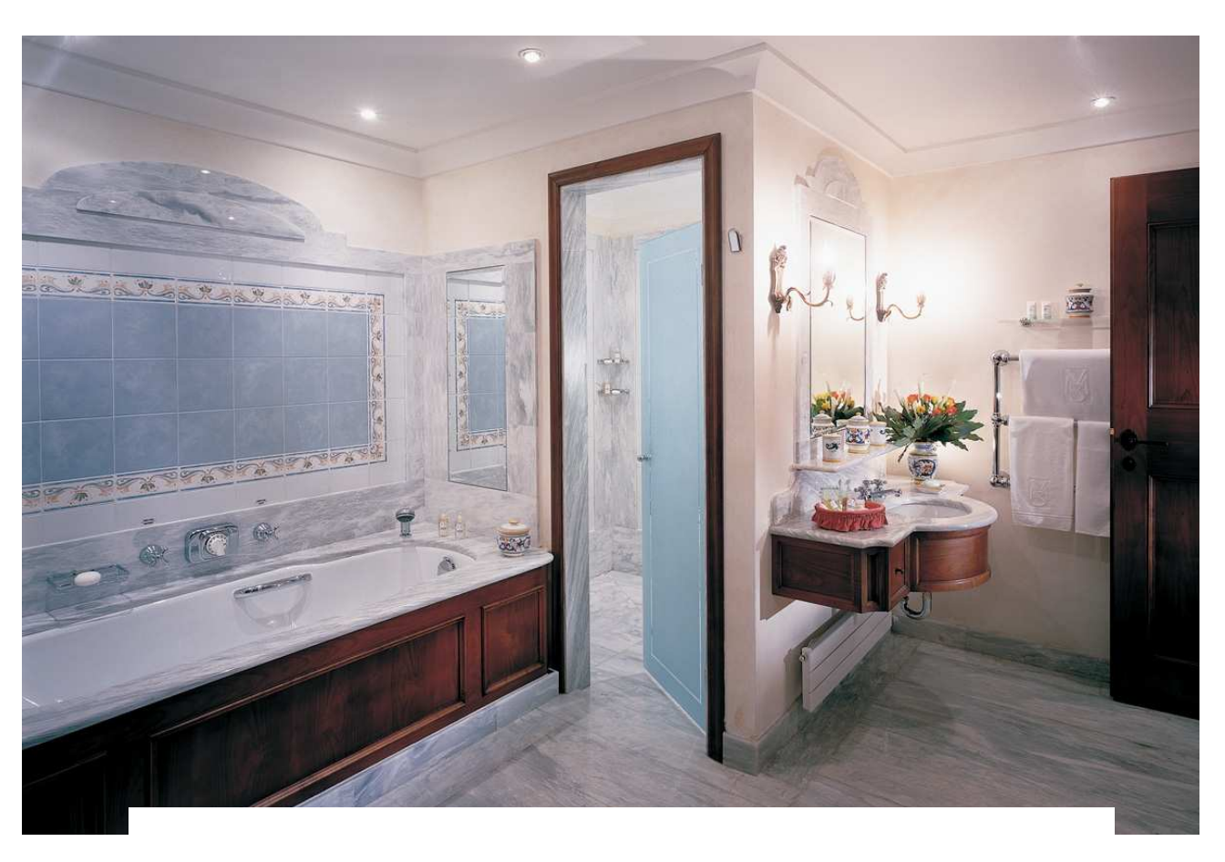
Recently renovated, all the Garden Suites offer separate living rooms and every comfort. One extra bed may be added in the lounge for children sharing the room with their parents.