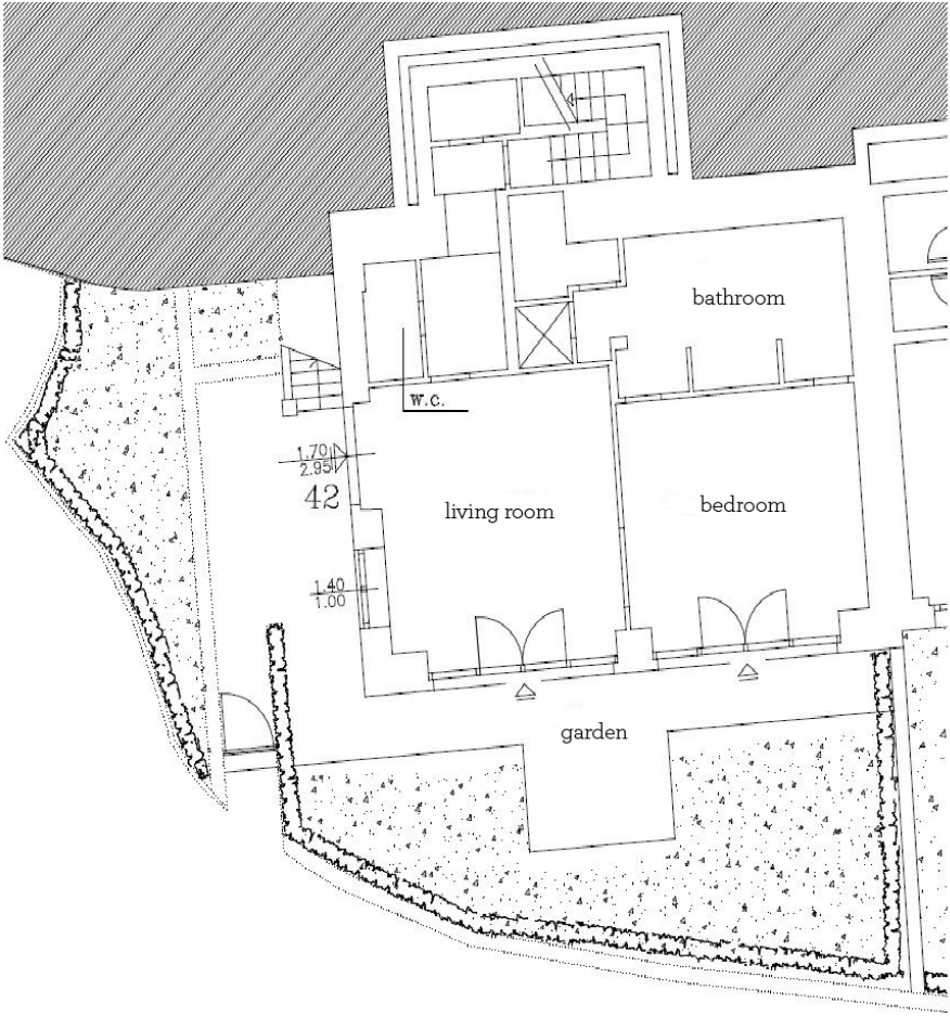
GARDEN SUITE - 42