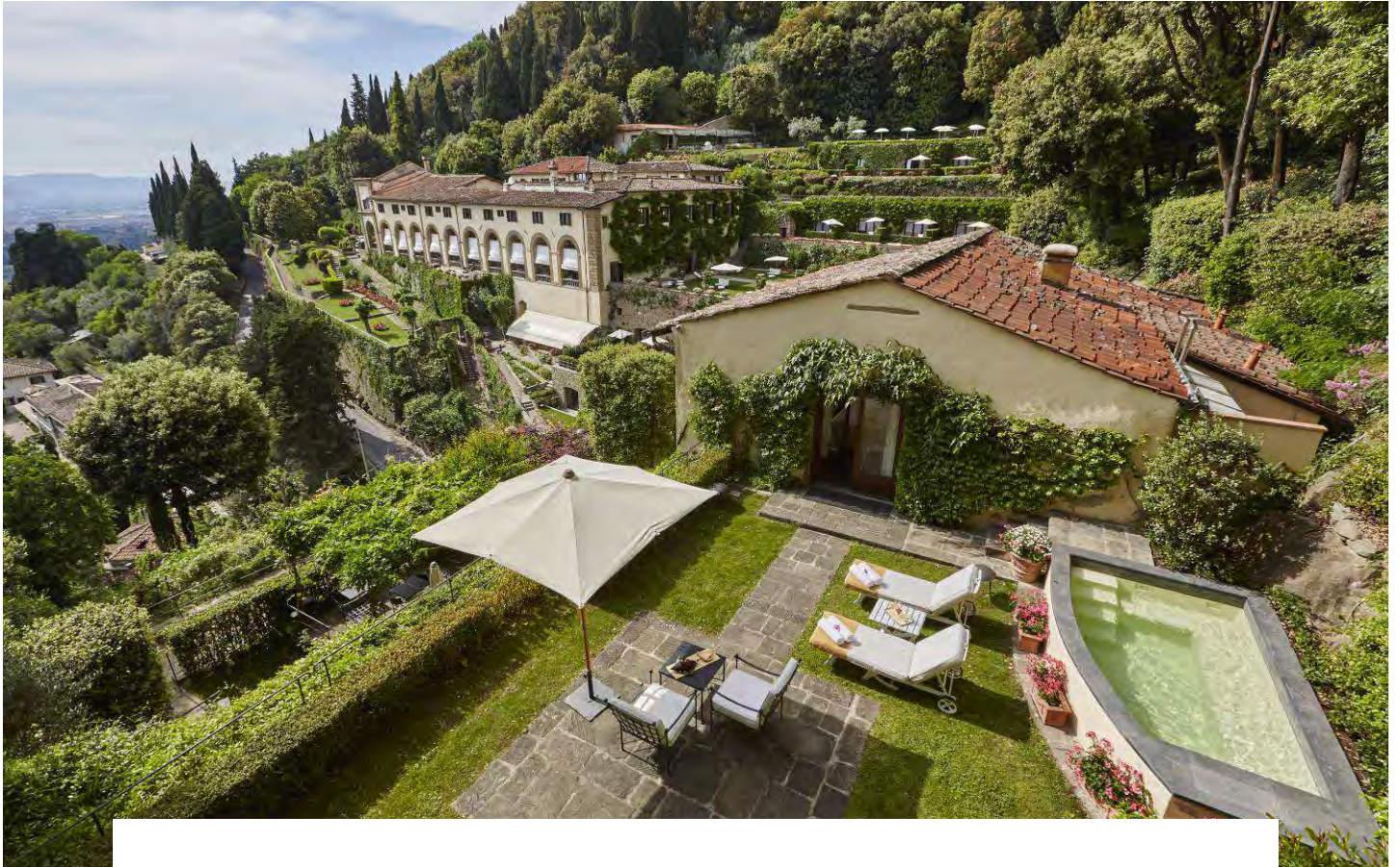
The Limonaia's private garden has its own heated plunge pool, made from stone, and a small waterfall that blends in perfectly with the leafy surroundings.