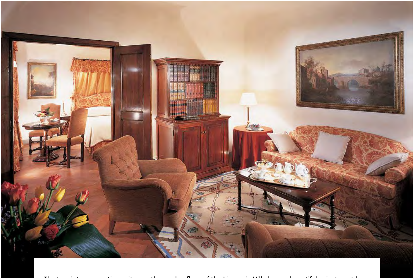
The two interconnecting suites on the garden floor of the Limonaia Villa have a beautiful private outdoor, where guests can enjoy breakfast or dinner in total privacy.