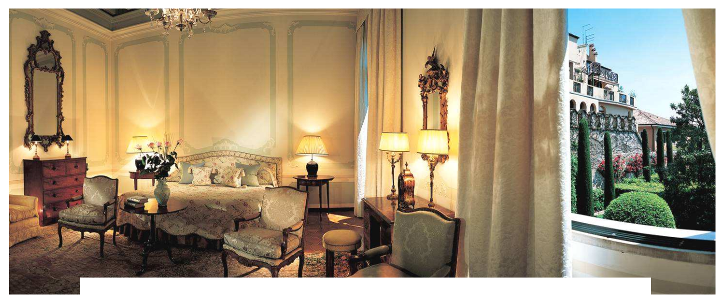
The sitting room, the largest in the Palazzo Vendramin , is decorated with original 18th century Coromandel screens, a remarkable collection of antiques enriched by priceless Fortuny and Rubelli fabrics. A spacious corridor leads on to the elegant pink marbled bathroom and the airy master bedroom, overlooking peaceful gardens.